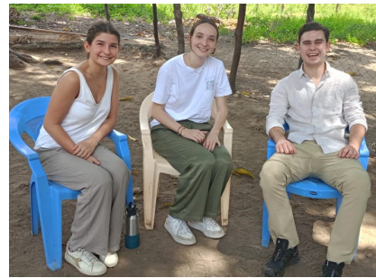
Students from the University of La Rochelle arrive.