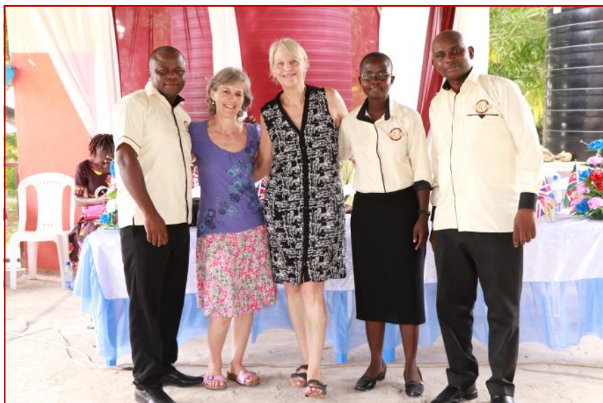
Unity Management, Trustees and former Pupils during the 10 year celebration