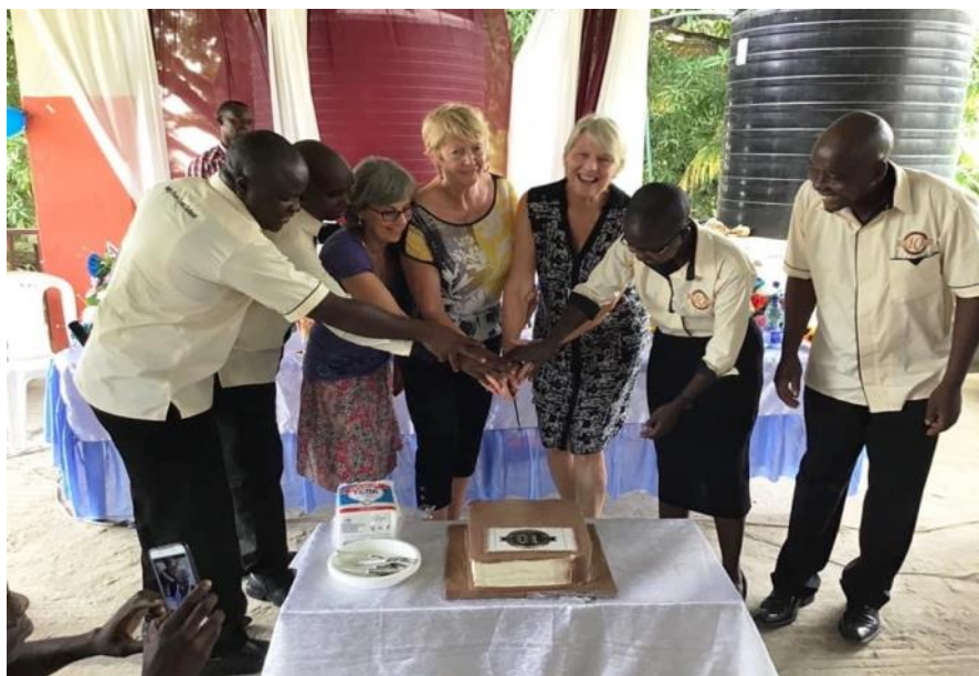
Cutting the cake and lots of excitement from the pupils