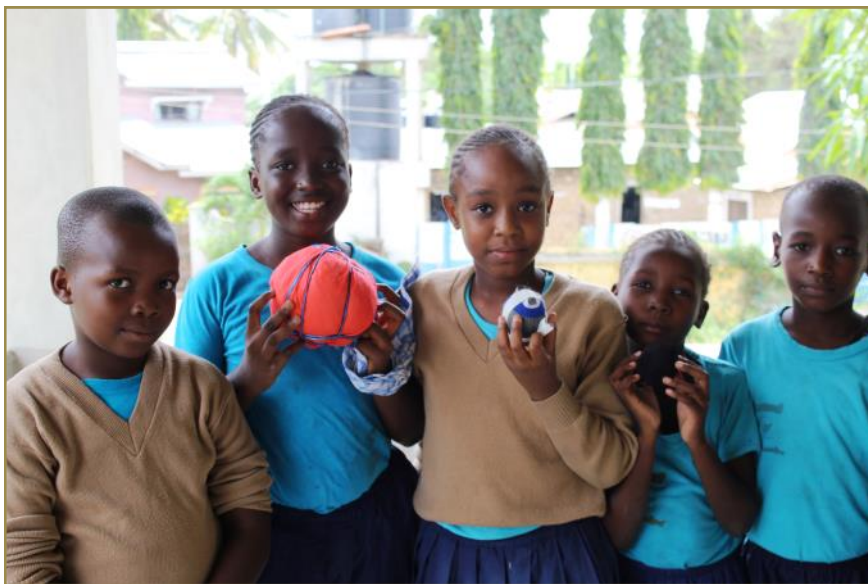
Making balls out of paper and string